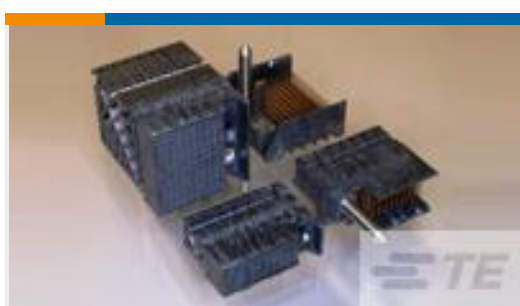
TE Part # 2057405-1 IMP100S,R,RA2P10C,UG,39